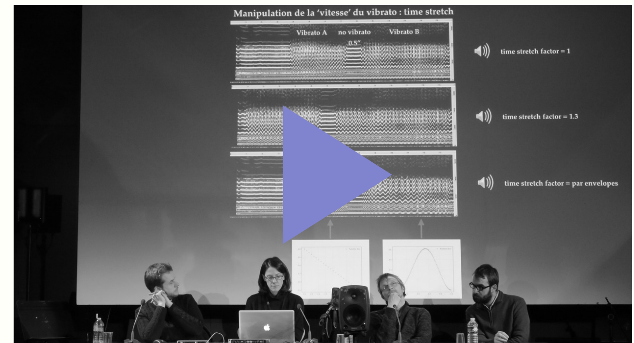
Forum Workshops - Sneak Peek